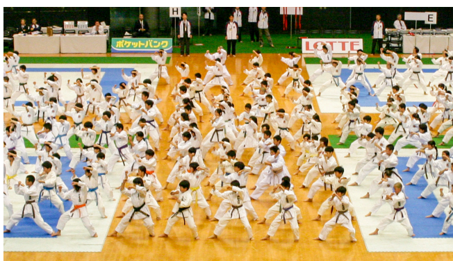
Junior demonstration by children from all over Japan including demonstrations of katas from different styles of Karate-Do