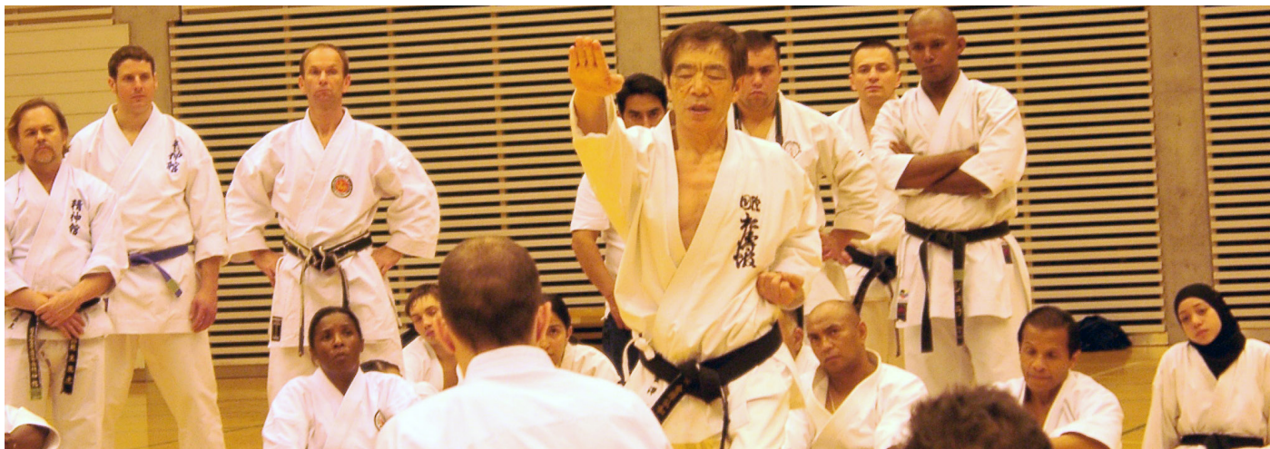
Soke Hirokazu Kanazawa demonstrating Kanku-Dai at the SKIF Yudansha-Kai Seminar in Tokyo

During the 9th SKIF World Championships week, SKIF Yudansha-Kai held their special seminar under Soke Hirokazu Kanazawa assisted by several SKIF instructors. This seminar covered special kata training for the championships.