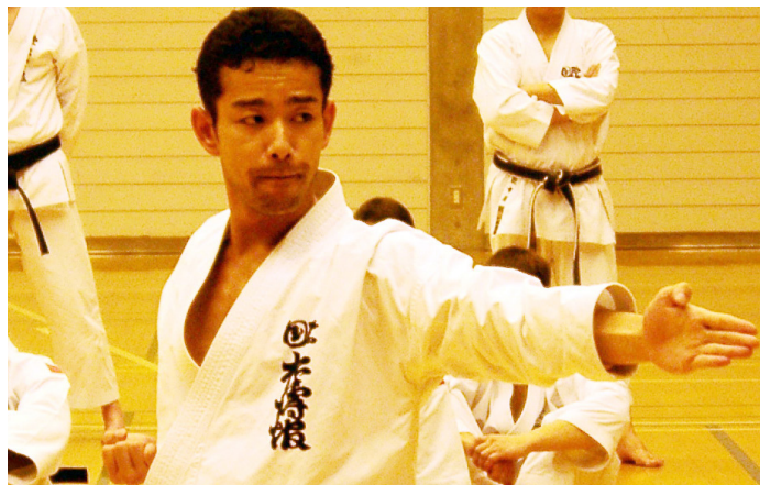
Sensei Fumitoshi Kanazawa demonstrating at the SKIF Yudansha-Kai Seminar in Tokyo