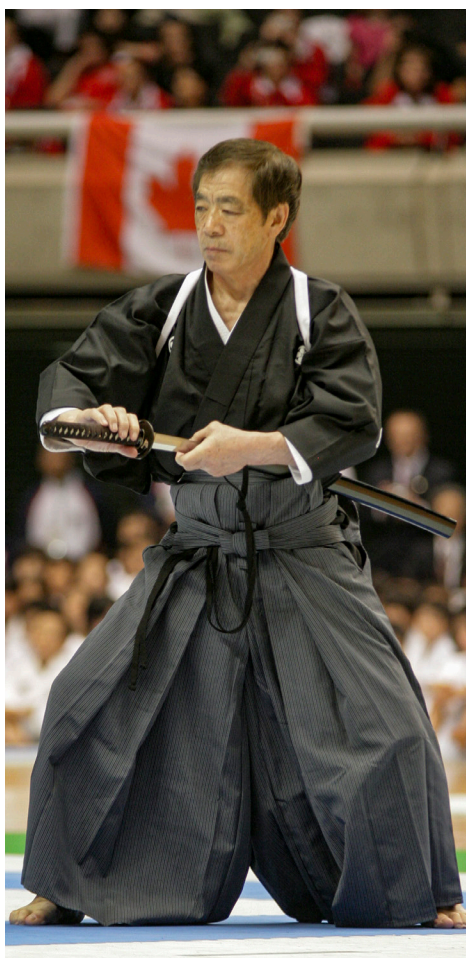
Soke Hirokazu Kanazawa performing an impressive katana demonstration