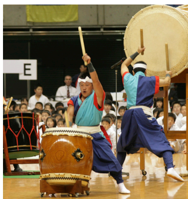
Taiko Drums demonstration